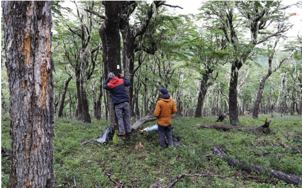
Installing an iButton device to measure humidity and temperature in a Lenga forest ( Nothofagus pumilio ) in Patagonia

Sustainable forest management of temperate deciduous forests (northern-hemisphere beech and southern-hemisphere southern beech forests) – Argentina