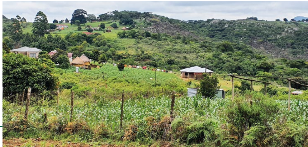
Community-owned land in the Vhembe District (Limpopo)

played a special role in South Africa as a result of land redistribution among the Black population after apartheid. However, communities often lack knowledge about how to manage these forests sustainably and how to adapt to climate change. Consequently, the land is often leased to large forestry companies, which once again creates a dependency structure for the communities.