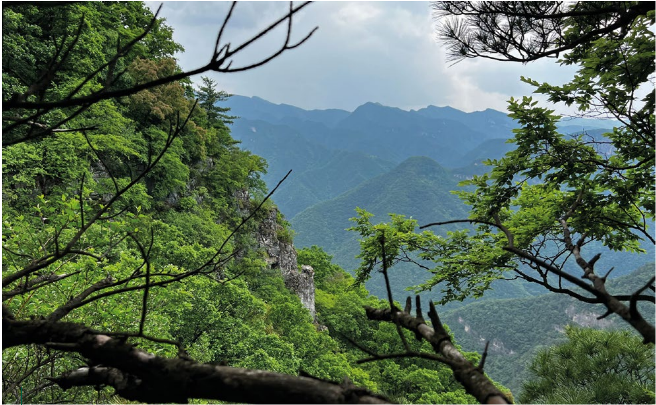
View of the mountains and forests of Shanxi Province, China