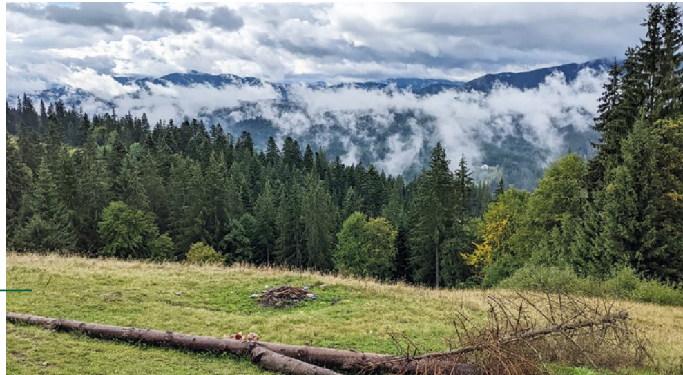
View of typical Ukrainian Carpathian forests, where inventory plots have been established to collect data

The different types of forests in different climate regions offer a variety of conditions and ways to use the forests. The concept and opportunities of sustainable forest management are currently being supported through the following projects: