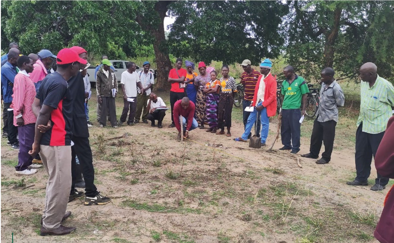
Trainers learn more about planting trees