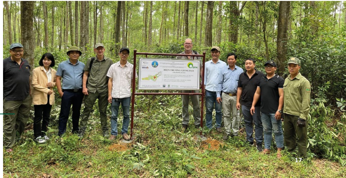
Training for the application of silvicultural techniques in acacia plantations

of recognized training in the area of forestry. The Forest Training Center in Dong Ha was established by the Vietnamese Academy of Forestry Science (VAFS), with support from the BMEL, during the initial project phase. The center offers practice-oriented training. In the second phase, the project aims to further develop skills for applying forest management methods in state-run and smallholder forestry operations.