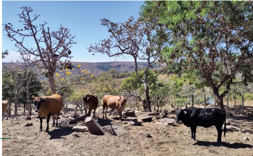
Traditional silvopastoral system near Poconé

That makes the Cerrado six times as the size of Germany. Due to the expansion of agriculture and the demand for grazing area, the region's natural vegetation is severely threatened.