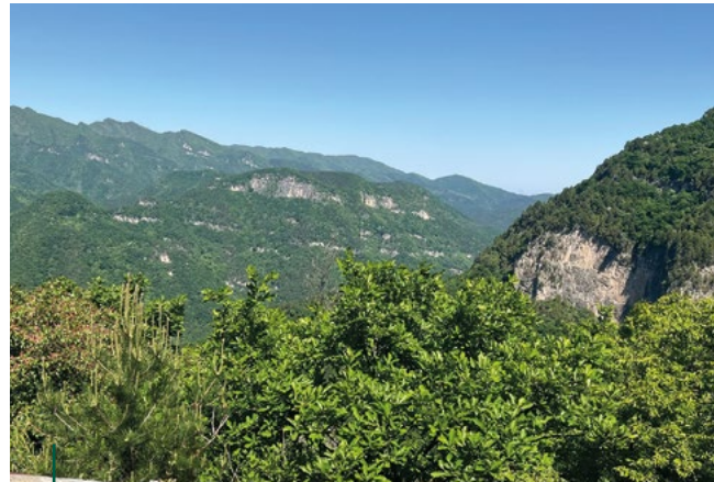
Forest locations with high conservation value for which case-specific plans are required

Supporting sustainable forest management by establishing a demonstration state-run forestry operation in Shanxi Province, China