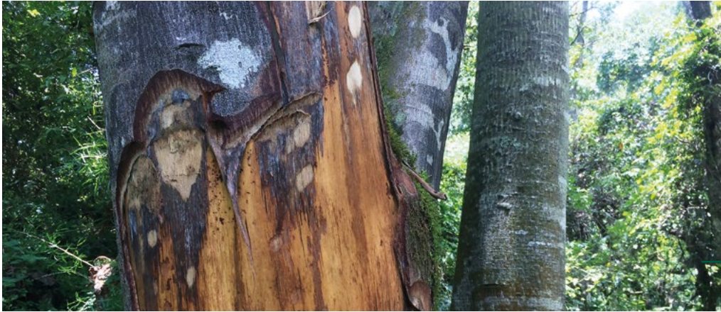
Harvesting bark for medicinal purposes

The BMEL also promotes exchanges between forestry policymakers and forestry scientists through financial support for the European Forest Institute.