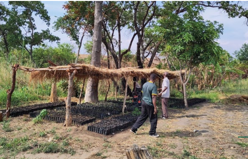
Nursery belonging to a group of farmers supported by the project in the district of Katete

Supporting agroforestry for the production of wood and silvicultural non-wood products in Zambia– Phase 2